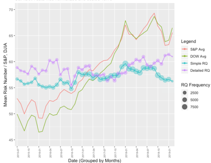
Simple RQ RN Overlaid with S&P and DJIA 4 (July 2015 to Present) S&P/DJIA data was normalized and scaled 40:70

Additionally, it's clearly discernible that after the market peak in January 2018, detailed Risk Questionnaires continued to rise even as the market experienced a brief downturn.